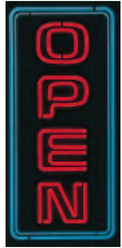
OPEN VERTICAL CL-25-OPEN-V