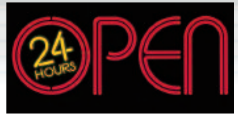
CL-25-OPEN OPEN 24 HOURS