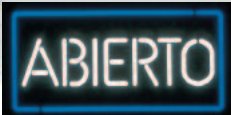
ABIERTO (SPANISH OPEN)