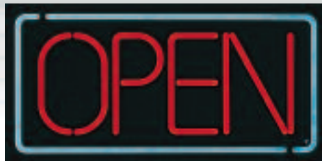
CL-25-AB OPEN (RED)