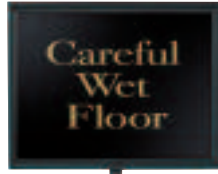
BLACK TELLER MODEL NO: T14-BLACK