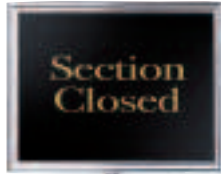
CHROME TELLER MODEL NO: T14-CHROME