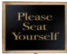
BRASS TELLER MODEL NO: T14-BRASS