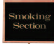
PARK AVENUE MODEL NO: PA-TELLER