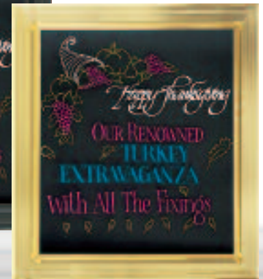
Model No: LWE-2528-B