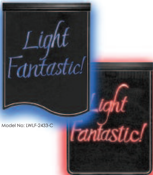
Model No: LWLF-2433-C