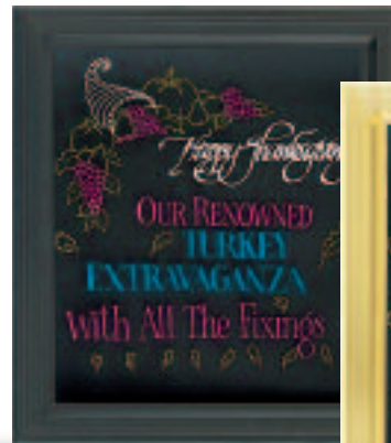
Model No: LWE-2528-A

All three COMET write-on board styles are available in two sizes – 26" x 34" and 25" x 28". Choose the size and the finish that most closely meets your needs.