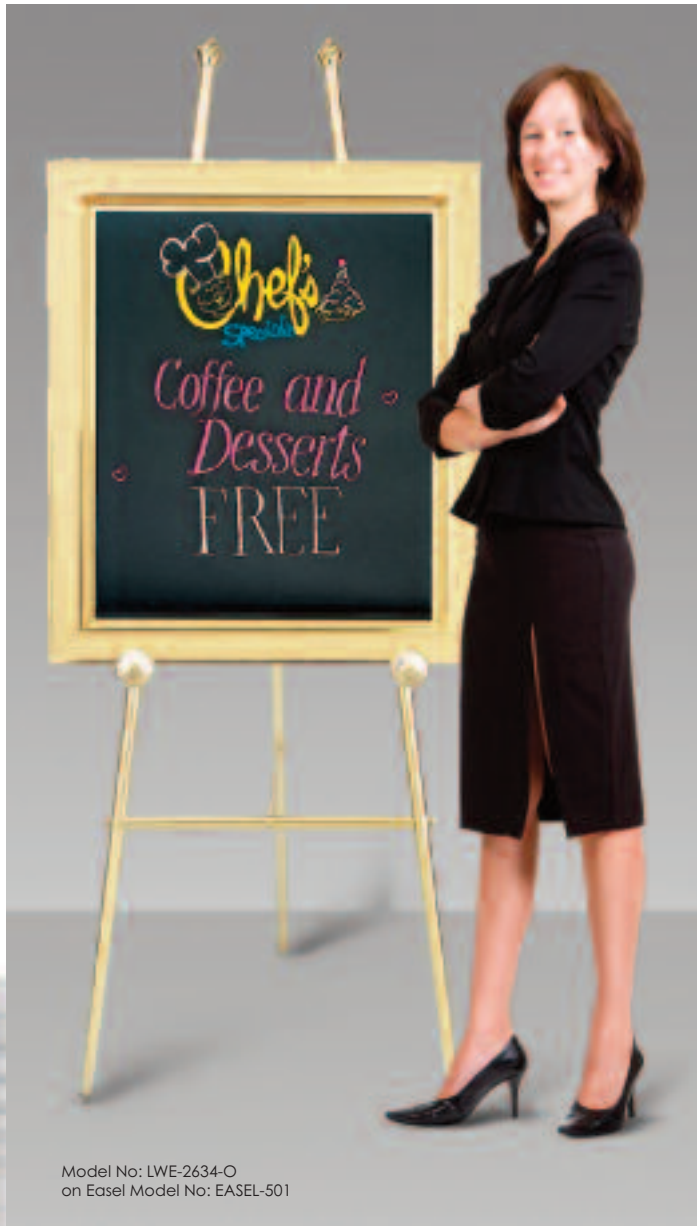
Model No: LWE-2634-O on Easel Model No: EASEL-501