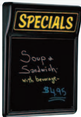
Model No: LOWO2K-Specials