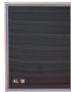
MODEL NO: AL-1824-OF-BK

*O/S = OVERSIZED +OF/HG = OPEN FACED / HINGE FACED