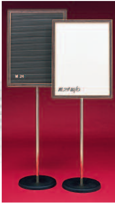
MESSAGE DIRECTOR MODEL NO: MSR-1824-STD-BN