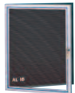
MODEL NO: AL-1824-HG-BK