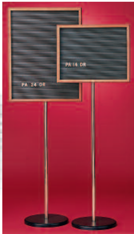
PARK AVE MODEL NO: PADR-1824-OF-BN