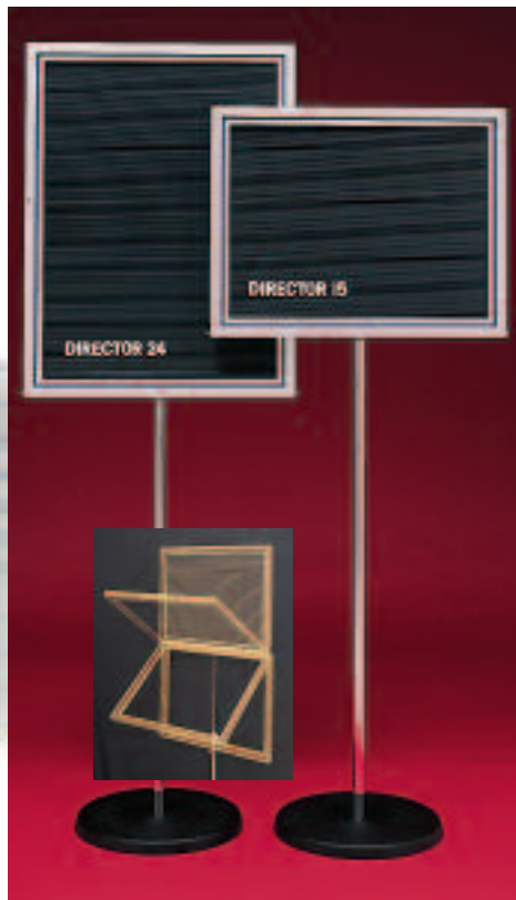
ALUMINUM LINE MODEL NO: ALDR-1824-OF-BN