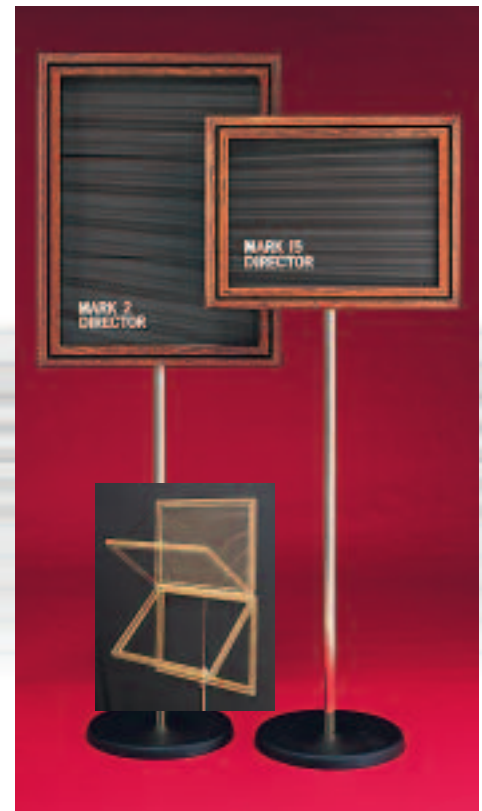
MARK LINE MODEL NO: MK2V-DR-OF-BN