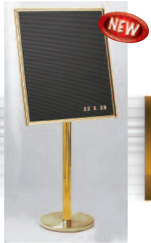
THE GUIDEPOST MODEL NO: GP-LP-02-2228