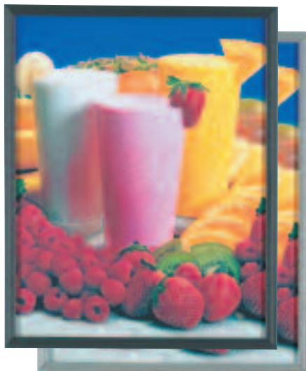
MODEL NO: PH-2228-BKSL