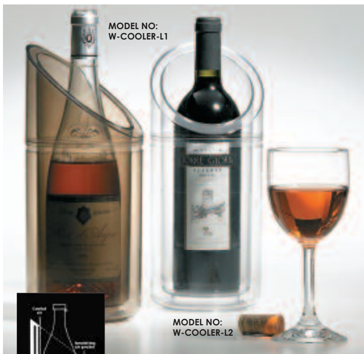
MODEL NO: W-COOLER-L1