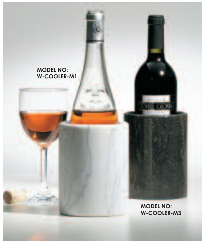
MODEL NO: W-COOLER-M1