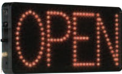
Model: LED-OP-1607-R Size: 16 x 7