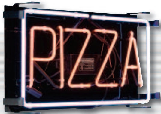
Model: NFR-PZ-2413-RG Size: 24 x 13