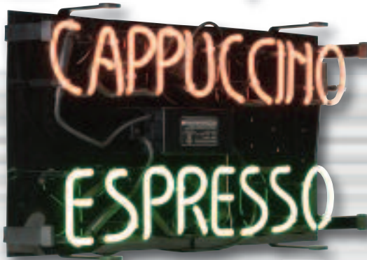
Model: NFR-CE-2413-RG Size: 24 x 13