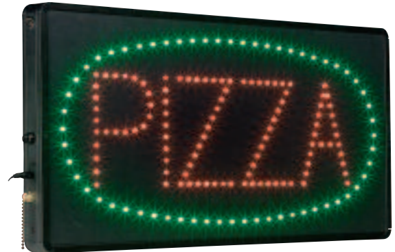
Model: LED-PZ-2412-RG Size: 24 x 12