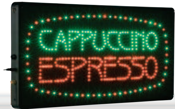
Model: LED-CE-2412-RG Size: 24 x 12