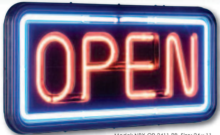
Model: NBX-OP-2411-RB Size: 24 x 11