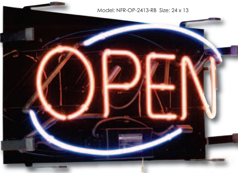
Model: NFR-OP-2413-RB Size: 24 x 13